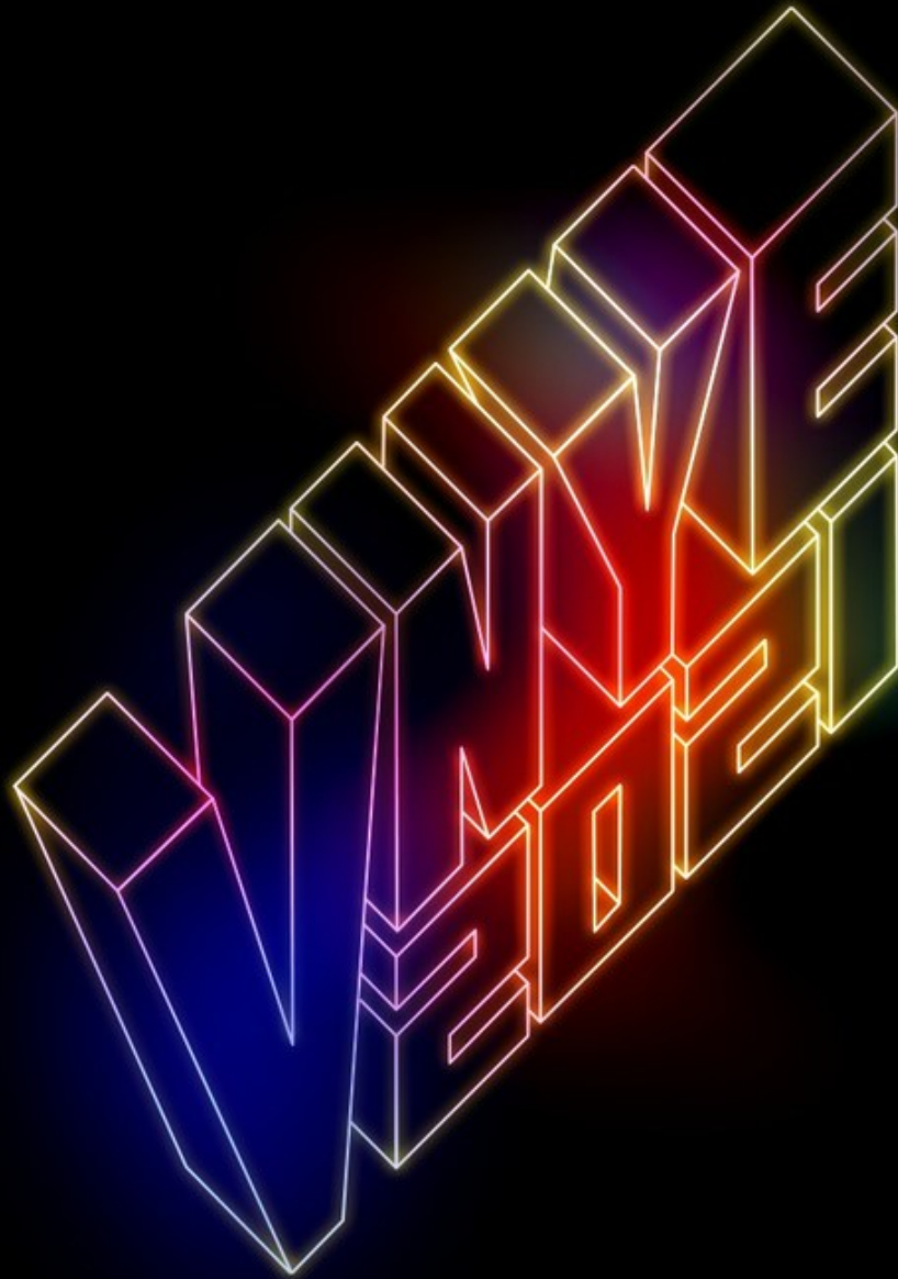
VNYE Logo (PRNewsfoto/Jamestown)